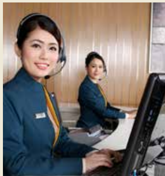
Professional Service 專業服務

2012 亞洲殯葬博覽及會議 • 亞洲傑出殯葬服務企業品牌大獎 • 亞洲傑出跨國企業發展大獎 Asian Funeral Exhibition (AFE Awards) ▪ Asia Outstanding Brand in Funeral Services Industry ▪ Asia Outstanding Award in Multi National Expansion