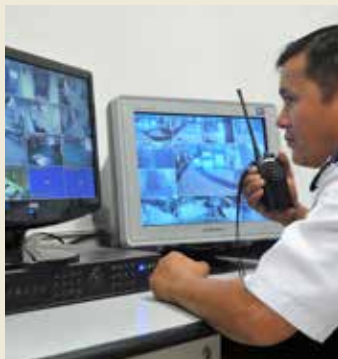
24 hour Security 24小時保安