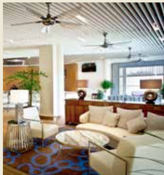
Rest Area 寬闊休息處